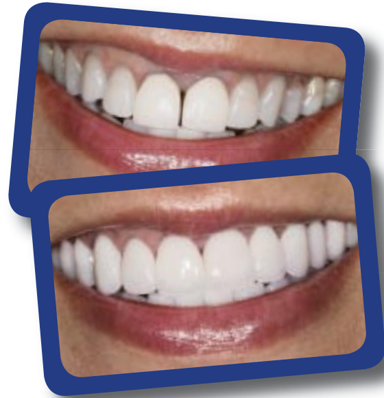
New beautiful natural-looking front crowns are enhanced by veneers on the molars.

Crowns have come such a long way from the all-metal originals, through porcelain fused to metal, and finally to all-ceramic or all-porcelain. Today, replacing outdated crowns is a surefire way to take years off your appearance.