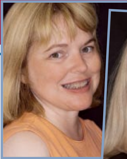
Dare to turn heads with a smile that's been radiantly rejuvenated!

Make your zest for the best work for you. Live life to the fullest ... and smile, smile, smile!